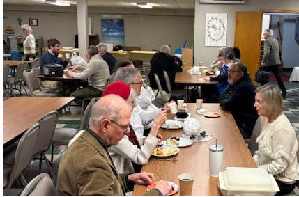
Pictures from our quarterly luncheon and the Installation of Elders and Deacons