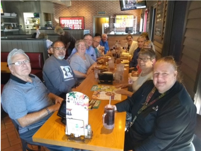
Our Lunch Bunch crew at Famous Dave's .

The next meeting of "Presbyterian Women" is May 7th. Please mark your calendars and join us....we love newcomers! All are invited to participate in this Presbyterian Women's Circle.